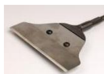
Bevel Edge 431.3908

Button head screw Part No. 806.0816 Nylon insert nut Part No. 824.0800