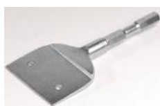
Blade holder: 641.3512