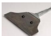
Flat Edge 431.3508